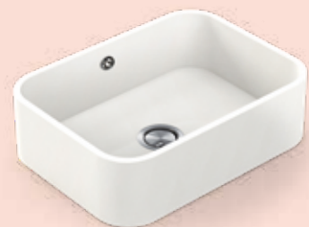
→ Integrity DUE L 51 x 37 x 15.5 cm Radius 6.5cm