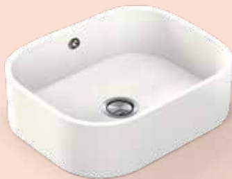
→ Integrity ONE 51 x 41 x 15.5 cm Radius 13cm

Integrity Q is our new sink featuring a monolithic, minimalist design.