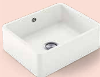
→ Integrity Q 51 x 41 x 15.5 cm Radius 3cm