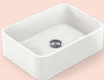
→ Integrity DUE XL 67 x 43.5 x 21 cm Radius 6.5cm