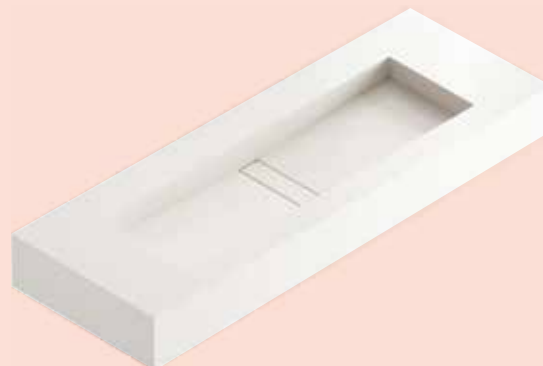
→ Reflection S Basin 49 x 30 x 8 cm M Basin 90 x 30 x 8 cm L Basin 120 x 30 x 8 cm