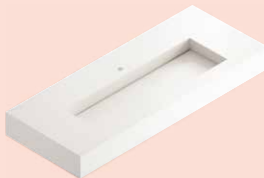
→ Silence S Basin 49 x 30 x 8 cm M Basin 90 x 30 x 8 cm L Basin 120 x 30 x 8 cm