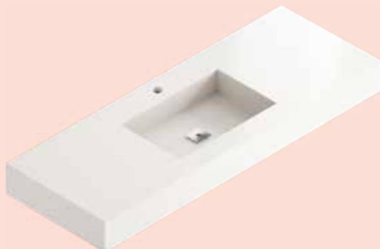
→ Elegance Basin 49 x 30 x 10 cm