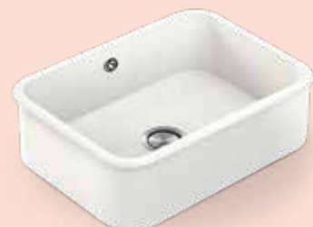
→ Integrity TOP 51 x 37 x 15.5 cm Radius 6.5cm