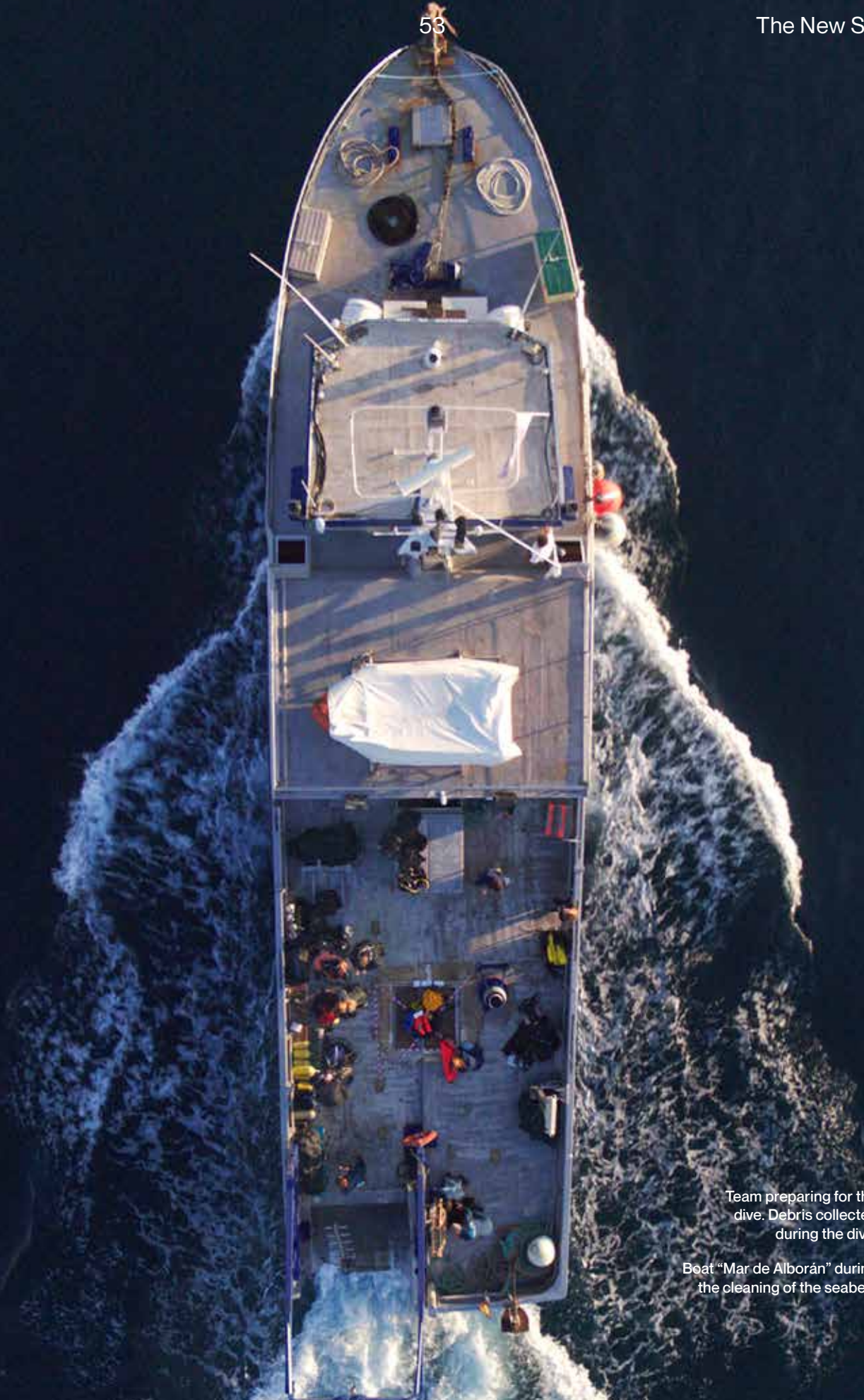
Team preparing for the ← dive. Debris collected during the dive.