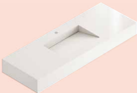
→ Armony Basin 49 x 30 x 10 cm