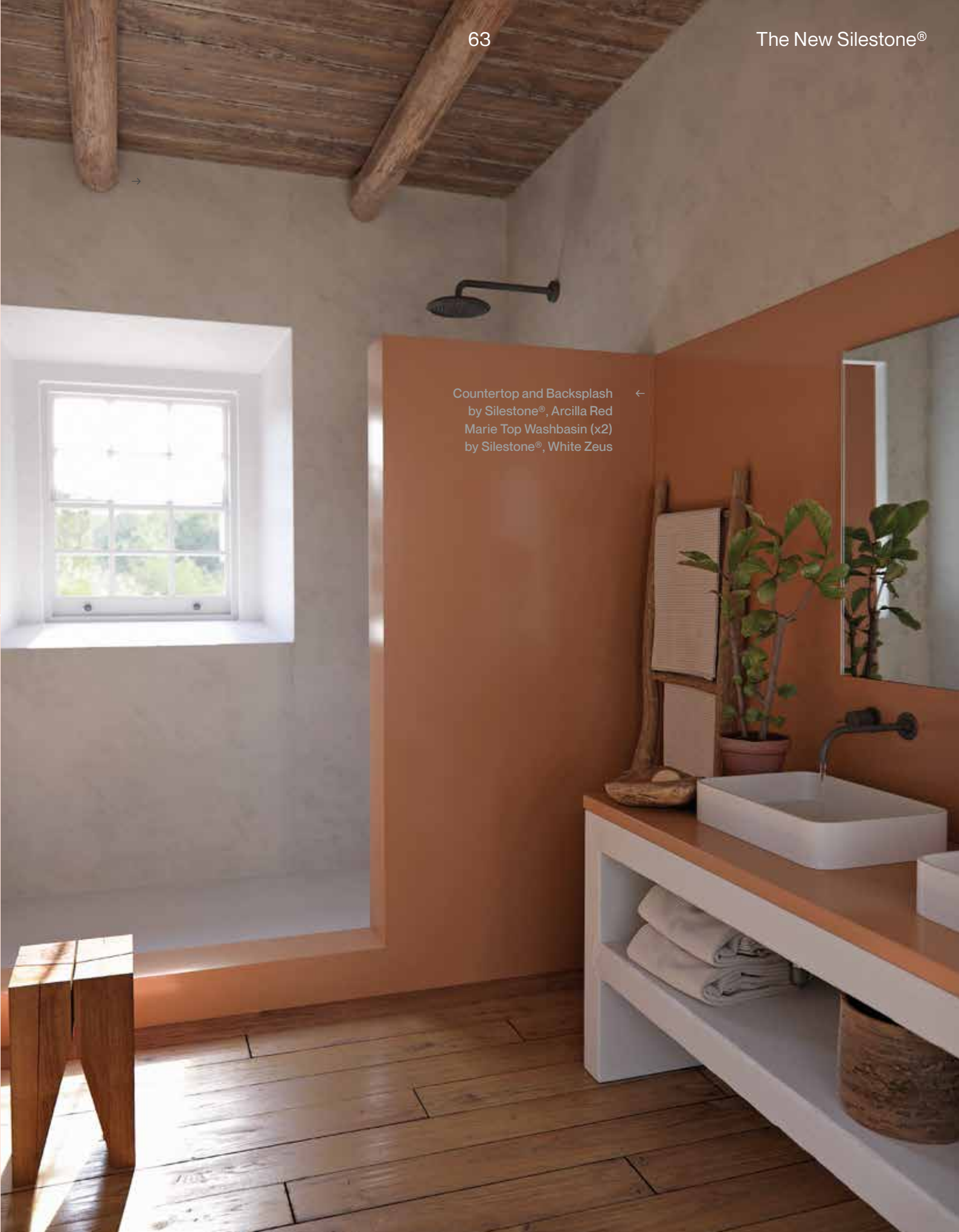
Countertop and Backsplash ← by Silestone®, Arcilla Red Marie Top Washbasin (x2) by Silestone®, White Zeus