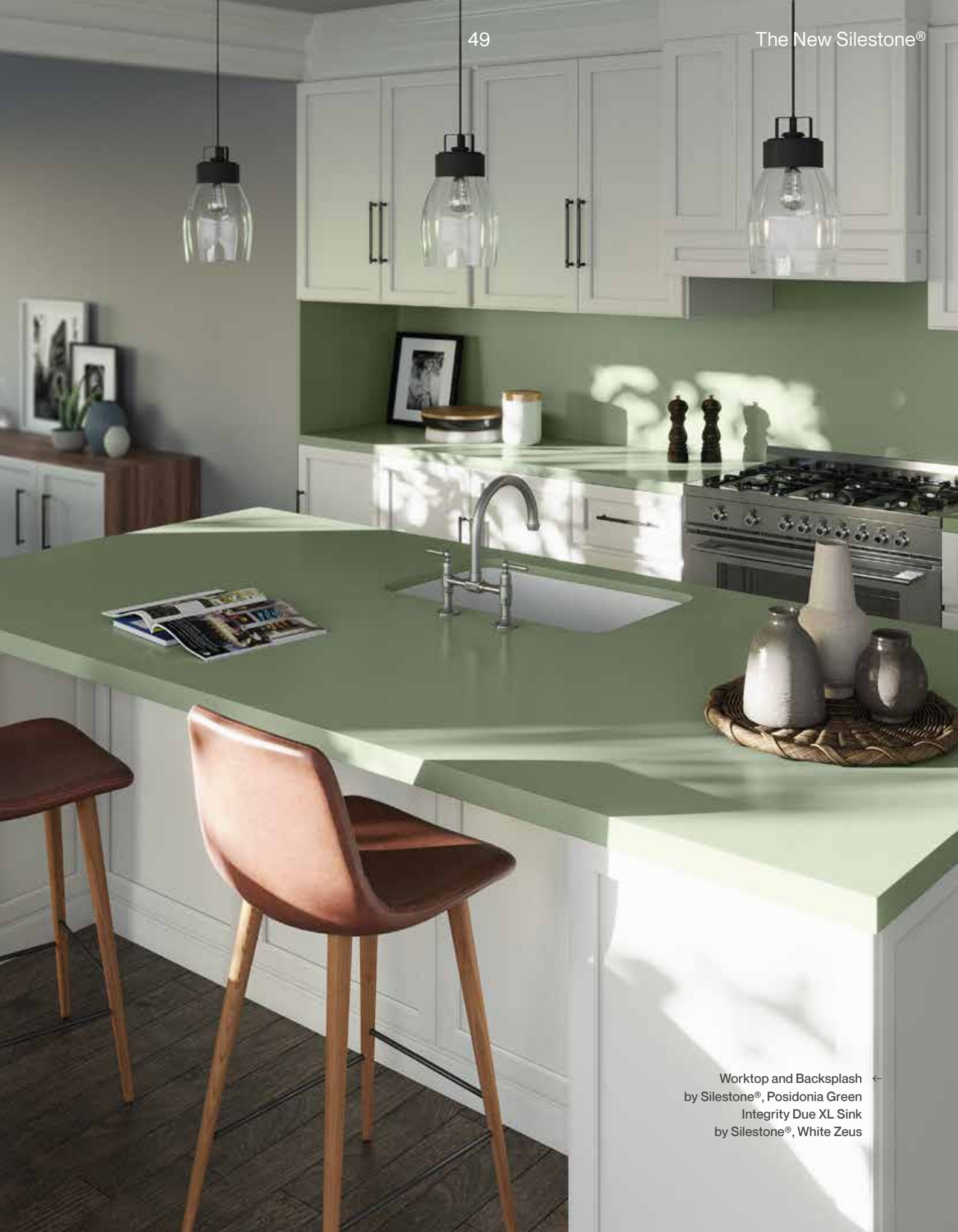
Worktop and Backsplash ← by Silestone®, Posidonia Green Integrity Due XL Sink by Silestone®, White Zeus