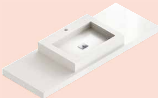
→ Symmetry S Basin 33 x 23 x 7 cm M Basin 38 x 25 x 7 cm L Basin 58 x 30 x 7 cm