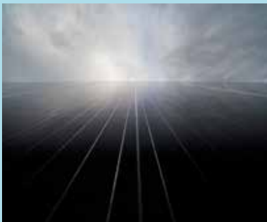
100% Renewable energy

HybriQ+® uses a minimum of 20% recycled materials in its composition, such as glass, and its manufacturing process is powered entirely by renewable energy and recycled water.