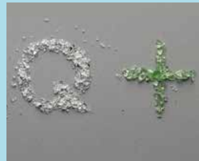
Made from recycled glass and minerals