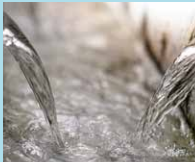
98% Recycled water