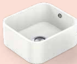
→ Integrity DUE S 34 x 37 x 15.5 cm Radius 6.5cm